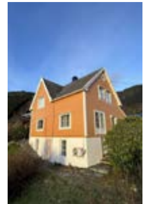
Family holiday home.