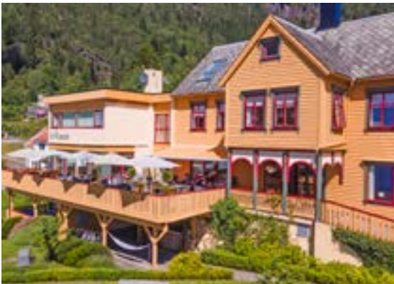
Hotel, restaurant, and private residence.

The original house was built in 1875. In 1968, an extension was added with hotel rooms, a function hall, kitchen, and more. On the adjacent plot stands an apartment building with three modern apartments. The same plot also contains a fully renovated family holiday home. In addition, there is a garage and a workshop on the property.